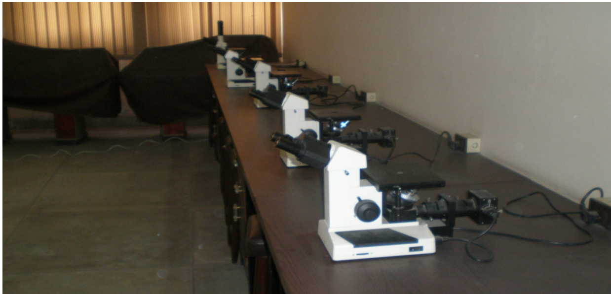
Metallurgical microscopes: X100 to X1000 Magnifications