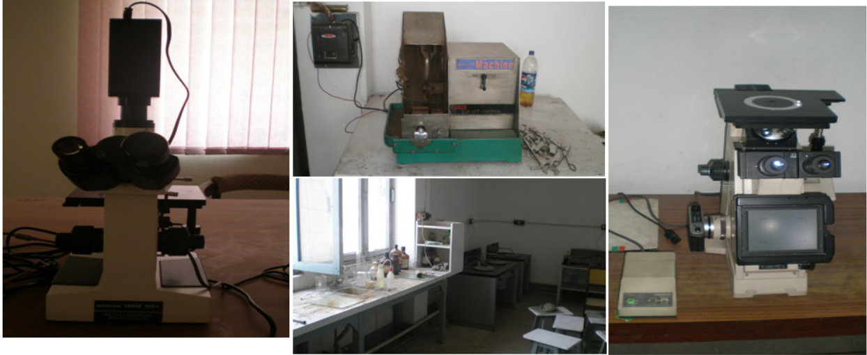
METKON IMM901 Metallurgical Microscope with Image analysis, Olympus PME3 Metallurgical Microscope and sample preparation apparatus.