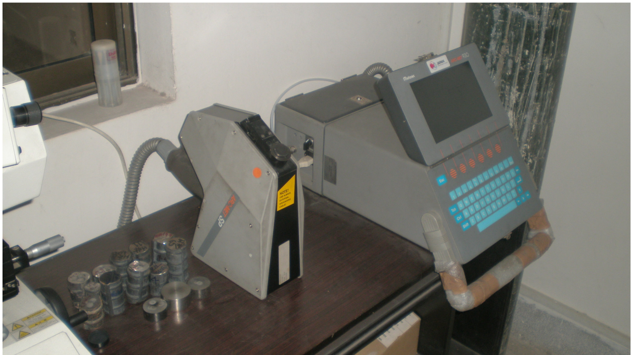
Spark Emission Spectrometer