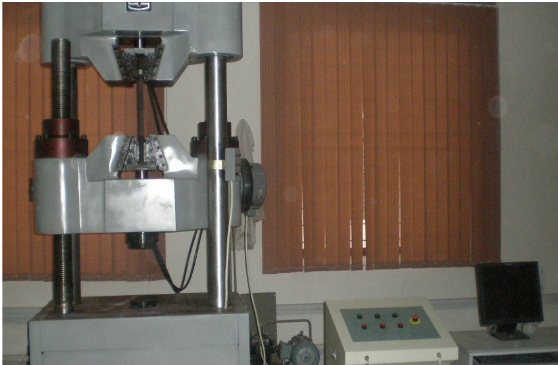
1000KN Universal Tensile Testing Machine